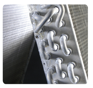
Aluminum tube and tube sheet after 500 hour salt spray.

Our patented All-Aluminum Comfort<sup>™</sup> Coils are designed to withstand common corrosives, even after 500 hours of sea salt spray test.