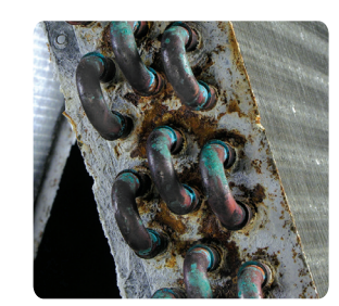
Copper tube and galvanized tube sheet after 500 hour salt spray.