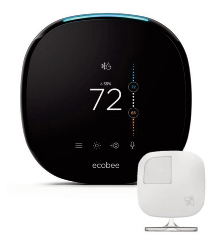
EB-STATE4P-01 (USA Part Number)