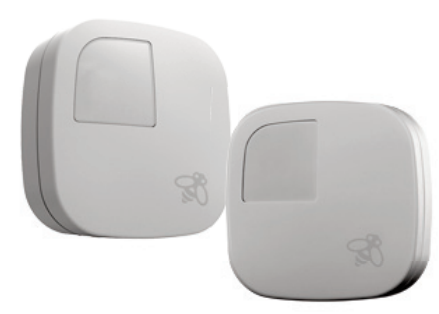
EB-RSE3PK2-01 (USA Part Number)