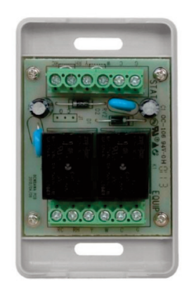
EB-PEK-01 (USA Part Number)

The ecobee EB-PEK-01 Power Extender Kit simplifies the installation of a EB-EMSSi-01 thermostat in applications where there is no existing common wire available for installation.