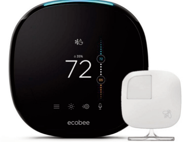
Smart Home Residential Thermostat with Room Sensor . . . . . . 4