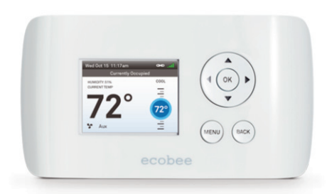
EB-EMSSi-01 (USA Part Number)