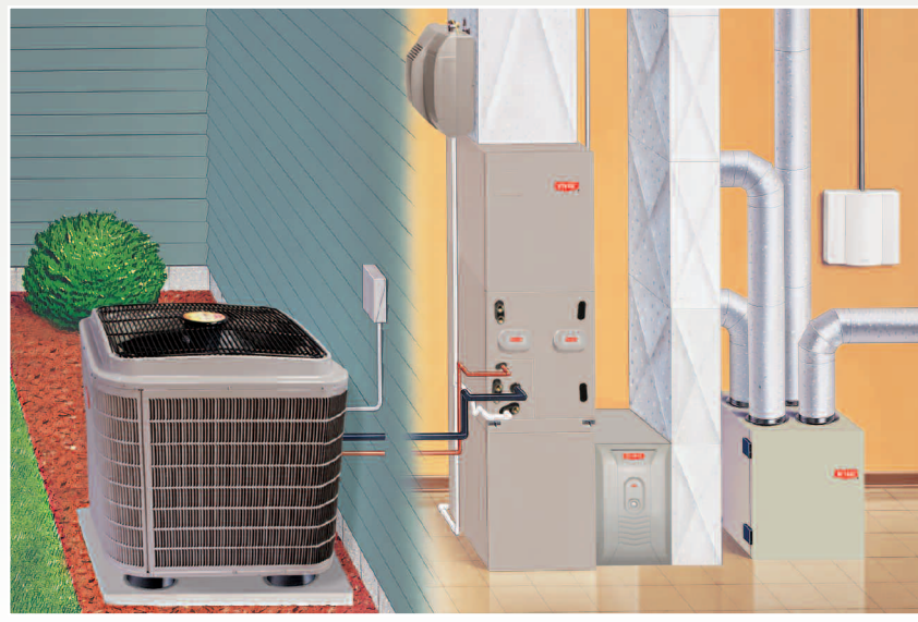
Heat Pump and Fan Coil System